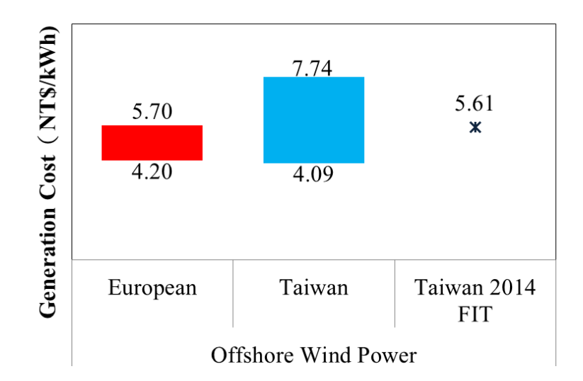
Figure 2 Comparison of offshore power cost

Aside from cost-benefit analysis, this paper also applies the GEMEET model to comprehensively discuss the relationship between FIT policy and R&D investment and the government's renewable energy promotion targets. Table 2 inspects how much additional R&D investment is still needed to meet the policy targets for renewable generation under the FIT scheme. The results show that significantly increase the growth of R&D investment in the initial stages of offshore wind power technology development is needed. In 2013-2015, an annual growth rate of around 45%, as compared to 6.67% in the other two renewable sources, might be needed to inject enough momentum to the industry in the early stages. Through the learning effect and future innovations in the industry, the government's financial obligation to support R&D can be reduced in the mature period (2026-2030).